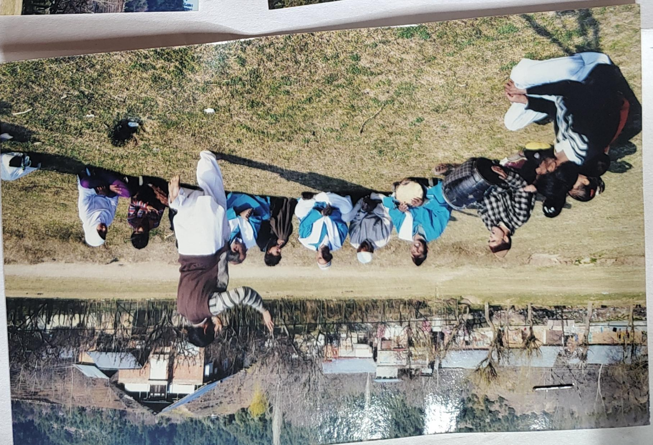
ALAMDAR, BHAGHAT THEATRE MOHRI PORA ANANTNAG RASHMIK