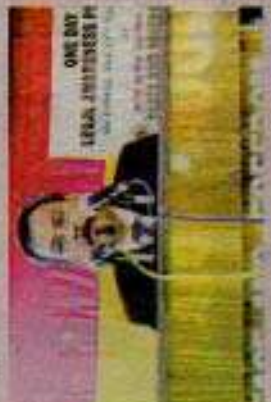
হাই এল গী য় অমসুং শিঙ জই কেগে হাঃ সনগা পুনা সুংখামুনা হাঃখোকপা লিয়েল থুঙাও লাইব্রেরীগী কমিউনিটি হোলনা পাঃখোকপা লিয়েল হাঃখোকপা লিয়েল