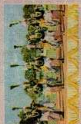
সিঙিঙ লিয়েল সাৰ্বিসেস ওখোহিগি, থৌবমগী হাইয়েন মখলা শিহ এম ট্রান্স একাডেমিগা হীন্দুনা একাডেমি অসিনী হোলনা পাঃখোকপা লিয়েল একাডেমিগে প্রোগ্রাম